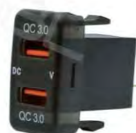
WNS-C03 Dual Big Toyota QC3.0+Digital

Input: DC12-24V Output: 5V/3.1A Material: ABS+Copper Size: 40*20mm