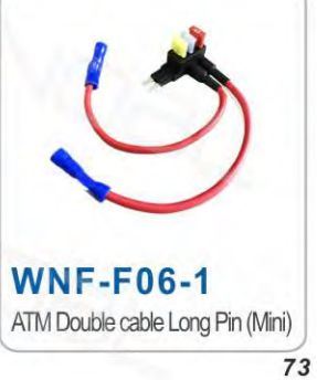
WNF-F06-1 ATM Double cable Long Pin (Mini)