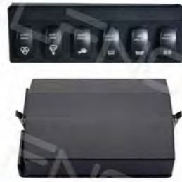
IB-PJ601 6 Gang Control Box with Switch

Input: DC 12-24V Material: Aluminum+PVC Function selection: Physical button Shell color: BU/BL