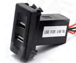
WNS-D14 Volkswagen T4 Dual USB(Convex)

Input: DC12-24V Output: 5V/2.1A Material: ABS+Copper Size: 38*22mm