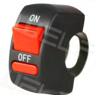
DS022M01 Electric Vehicle Motorcycle 23*20*44mm