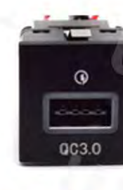
WNS-D09 Volkswagen QC3.0