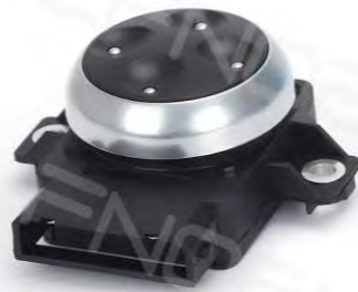
IY-007 Four way lumbar switch