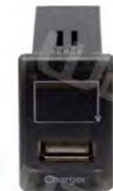
WNS-C14 Mazda USB+Digital

Input: DC12-24V Output: 5V/4.8A Material: ABS+Copper Hole size: 38*20mm