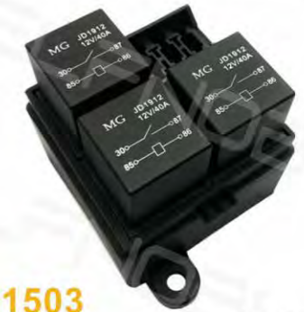
WNF-B1503 3-Way Relay Fuse Box

Input: DC 12-24V Current: 40A-80A Fusing speed: F