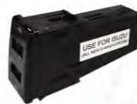
WNS-B16 Dual Honda USB Input: DC12-24V Output: 5V/4.2A Material: ABS+Copper Size: 40*20mm