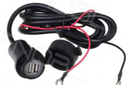
DS019M Double USB 3.1A 1.5 Meters cable