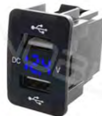
WNS-C13 Dual Toyota USB +Digital

Input: DC12-24V Output: 5V3.4A/9V2.5A/12V2A Material: ABS+Copper Hole size: 38*18mm