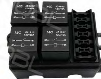
WNF-B1504 4-Way Relay Fuse Box

Input: DC 12-24V Material: Plastic Light color: BU/RD