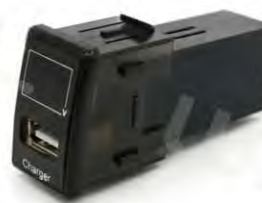
WNS-C15 Isuzu USB+Digital

Input: DC12-24V Output: 5V/2.1A Material: ABS+Copper Size: 32*32mm