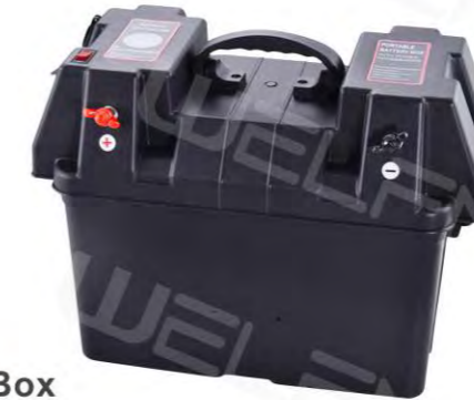
DS001H 75 Battery Box

DIRECT USB CHARGER AND ACCESSORY PORT-Provides one USB Charger and one 12V accessory port for convenient connection of various DC accessories.