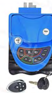
DS004D RV Door Lock -Full Metal Lock Material: Zinc alloy Color: Blue+colorful Keypad membrane