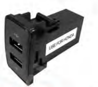
WNS-B19 Dual Mitsubishi USB Input: DC12-24V Output: 5V/4.2A Material: ABS+Copper Size: 37*20*69mm