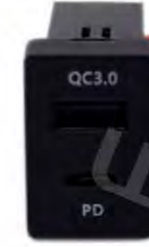
WNS-D03 Small Toyota QC3.0 +PD