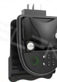
DS010D RV Lock(Fingerprint +password) Material: ZINC alloy+plastic