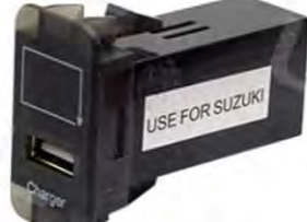
WNS-C17 Suzuki USB+Digital

Input: DC12-24V Output: 5V/2.1A Material: ABS+Copper Hole size: 37*20*69mm