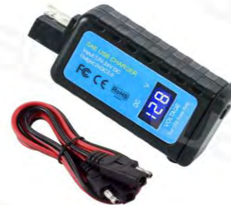
DS021M01 Double USB QC3.0*2+V 1 Meter SAE cable