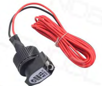
DS024M DC12V 120W