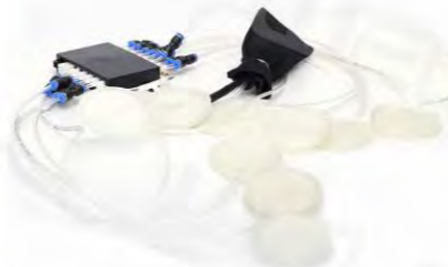
IY-013 Pneumatic 8-point massage