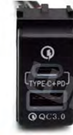
WNS-D07 Nissan QC3.0+PD