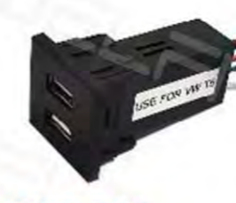
WNS-D11 Volkswagen T5 Dual USB

Input: DC12-24V Output: 5V Material: ABS+Copper Size: 32*32mm