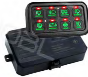
IB-PJ801 8 Gang Control Box

Input: DC 12-24V Material: Metal+ABS Light color: BU