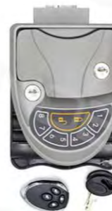
DS005D C02 RV Door Lock -Full Metal Lock Material: Zinc alloy Color: Grey+colorful Keypad membrane