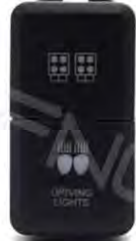
WNS-A02 Dual Big Toyota Switch Input: DC12-24V Material: ABS+Copper Size: 40*20*61mm