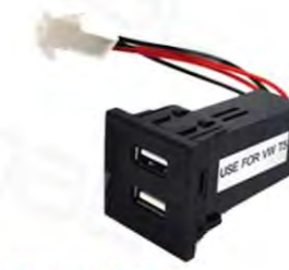
WNS-D12 Volkswagen T5 Dual USB(Concave)

Input: DC12-24V Output: 5V Material: ABS+Copper Size: 32*32mm