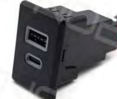
WNS-D17 Nissan PD+QC3.0

Input: DC12-24V Output: 5V/2.1A Material: ABS+Copper Size: 44*26mm