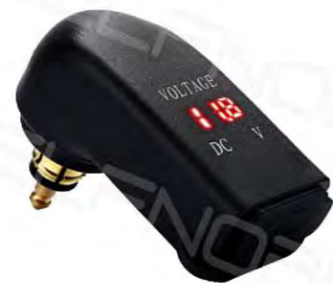
DS012M New BMW USB 2.4A*2+V