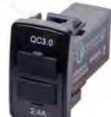
WNS-B18 Isuzu QC3.0+2.4A Input: DC12-24V Material: ABS+Copper Size: 42*22mm