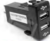
WNS-B01 Dual Big Toyota USB Input: DC12-24V Output: 5V/4.2A Material: ABS+Copper Size: 40*20mm