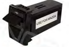
WNS-B23 Dual Mazda USB Input: DC12-24V Output: 5V/4.2A Material: ABS+Copper Size: 35*23mm