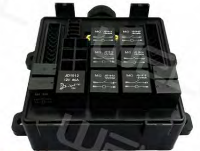
WNF-B1507 7-Way Relay Fuse Box

Input: DC 12-24V Material: Metal+ABS Light color: BU/RD