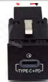
WNS-D10 Volkswagen Type-C +PD

Input: DC12-24V Output: 5V/2.1A Material: ABS+Copper Hole size: 35*24*58mm