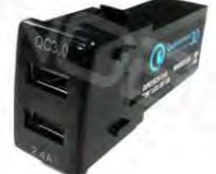
WNS-B21 Suzuki QC3.0+2.4A Input: DC12-24V Output: QC3.0+5V/2.4A Material: ABS+Copper Hole size: 42*22mm