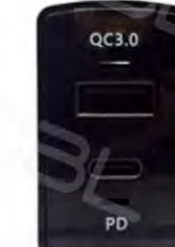
WNS-D05 Honda QC3.0+PD