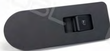
IY-010 Front passenger window switch