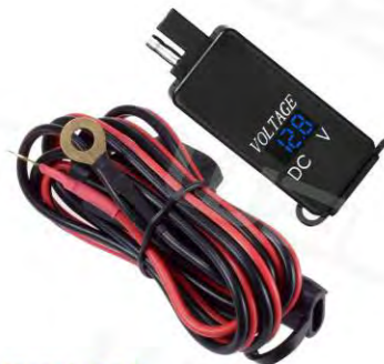
DS014M USB with Voltmeter QC3.0*2+V 1.2 Meters Fuse cable