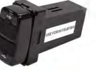
WNS-B10 Dual Isuzu USB Input: DC12-24V Output: 5V/4.2A Material: ABS+Copper Size: 30*22mm