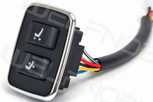
IY-001 Boss key switch