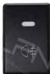
WNS-A18 T6 Isuzu Switch Input: DC12-24V Material: ABS+Copper Size: 53.7*33.6*22.4mm