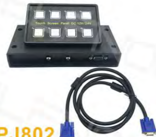
IB-PJ802 8 Gang Touch Screen Panel

Input: DC 12-24V Material: Metal+ABS Light color: BU