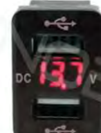
WNS-C05 Dual Small Toyota USB +Digital

Input: DC12-24V Output: 5V/2.1A Material: ABS+Copper Hole size: 32*20mm