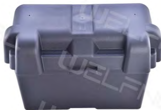
DS009H Smooth Battery Box

Product size(L/W/H):443*253*305mm Capacity size(L/W/H):380*197*242mm Net weight:1.28Kg