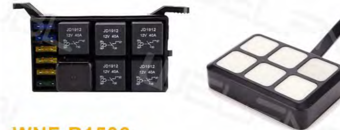
WNF-B1506 SR5U6 6 Gang Switch Panel with Relay Box

Input: DC 12V Material: Aluminum+PVC Function selection: Bluetooth APP/physical button Shell color: BL