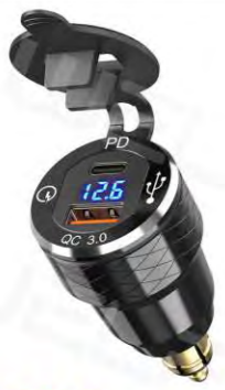
DS006M/A BMW AL USB QC3.0+PD3.0+V