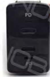
WNS-D06 Honda Dual PD

Input: DC12-24V Output: 5V/4.8A Material: ABS+Copper Size: 30*21mm