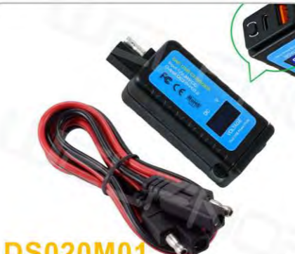
DS020M01 Double USB QC3.0+PD3.0+V 1 Meter SAE cable