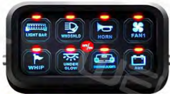
IB-PJ804 8 Gang Switch Box System

Input: DC 12-24V Current: 40A-80A Fusing speed: F