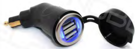
DS007M-3.1A(/3.1A) BMW USB 3.1A