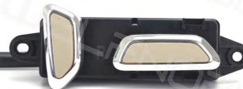
IY-003 Seat adjustment switch 4/6/8 way