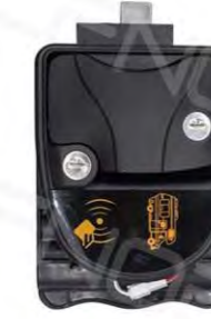
DS007D RV Door Lock(IC card wireless remote control) Material: Zinc alloy + plastic