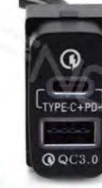
WNS-D08 Mitsubishi Type-C +QC3.0