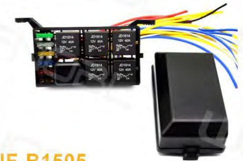
WNF-B1505 5-Way Relay Fuse Box

Input: DC 12-24V Current: 40A-80A Fusing speed: F