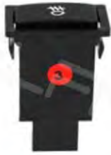
WNS-A06 T3 Corolla Switch Input: DC12-24V Material: ABS+Copper Size: 43*25mm