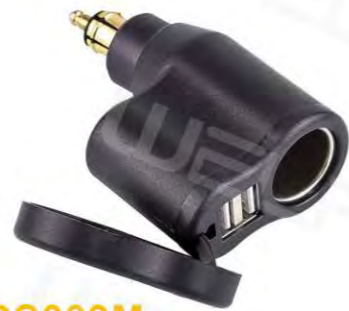
DS009M BMW USB 4.2A Cigar Socket:120W(Max)