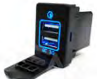
WNS-B13 Dual Nissan USB Input: DC12-24V Output: 5V/4.2A Material: ABS+Copper Hole size: 45*21*59mm