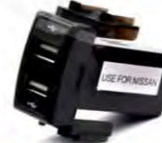
WNS-B07 Small Toyota QC3.0 +2.4A Input: DC12-24V Output: QC3.0+5V/2.4A Material: ABS+Copper Size: 32*20mm