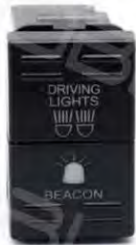
WNS-A11 T30 Dual Ford Switch Input: DC12-24V Material: ABS+Copper Size: 39*24*58mm