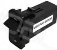
WNS-B11 Dual Nissan QC3.0 Input: DC12-24V Output: 5V3.0A/9V2.0A/12V1.5A Material: ABS+Copper Hole size: 28*20mm