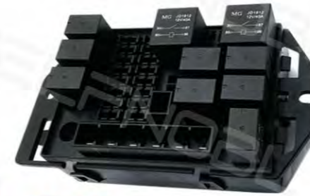
WNF-B1502 2-Way Relay Fuse Box(WULING)

Input: DC 12-24V Material: Metal+ABS Light color: BU/RD