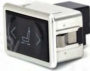
IY-006 Seat adjustment switch