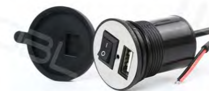
DS023M 1.5A/2.4A With Switch