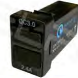
WNS-B04 Dual Small Toyota QC3.0 Input: DC12-24V Output: 5V3.0A/9V2.0A/12V1.5A Material: ABS+Copper Size: 32*20*38mm