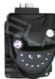
DS001D RV Door Lock V4.0 -Upgraded

Material: Zinc alloy + plastic Size: 151*118*88mm