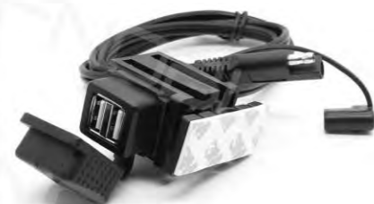
DS015M01 Double USB 3.1A 1 Meter SAE cable