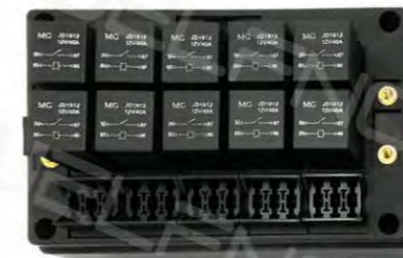
WNF-B1510 10-Way Relay Fuse Box

Input: DC 12-24V Voltage range: DC 9-30V Material: Metal+ABS Light color: BU/RD/GN/WH/OG