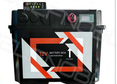
DS003H02 12V Battery Box

Size:250*420*330mm Switch:12-24V Voltmeter:12-24V USB:2xUSB QC3.0&2.4AMP Power socket:12-24V Anderson interface:100A/50A