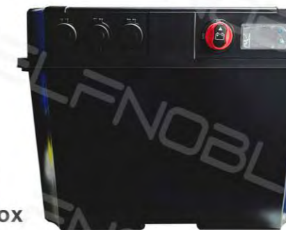
DS003H01 12V Battery Box

Size:250*420*330mm Switch:12-24V Voltmeter:12-24V USB:2xUSB QC3.0&2.4AMP Power socket:12-24V Anderson interface:100A/50A