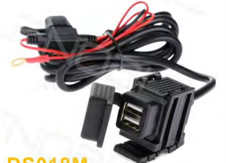
DS018M Double USB 3.1A 1.8 Meters cable