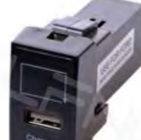
WNS-C18 Ford USB+Digital

Input: DC12-24V Output: 5V/2.1A Material: ABS+Copper Size: 42*22mm