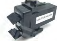
WNS-B08 Dual Small Toyota USB Input: DC12-24V Output: 5V/3.1A Material: ABS+Copper Hole size: 35*23*50mm