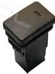
WNS-A03 Small Toyota Switch Input: DC12-24V Material: ABS+Copper Size: 32*20*52mm