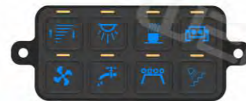
IB-PJ803 8 Gang Switch Box System with App

Input: DC 12-24V Material: Metal+ABS Light color: BU Size: 198*162*80mm