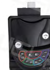
DS003D RV Door Lock V4.0 -Full Metal Lock

Material: Zinc alloy Color: Black+White Keypad membrane