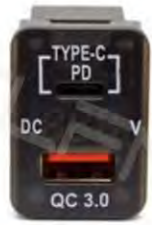
WNS-C06 Small Toyota PD +QC3.0+Digital

Input: DC12-24V Output: 5V3.4A/9V2.5A/12V2A Material: ABS+Copper Size: 32*20mm