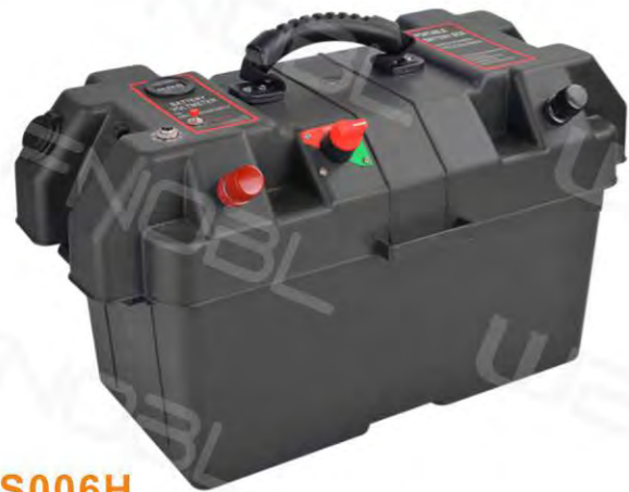
DS006H Smooth Battery Box

Material:PP Product size(L/W/H):430*252*325mm Capacity size(L/W/H):356*206*210mm Net weight:1.64Kg