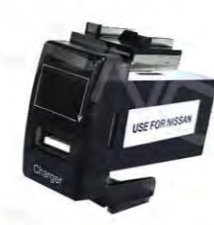
WNS-C09 Nissan USB+Digital

Input: DC12-24V Output: 5V3.0A/9V2.0A/12V1.5A Material: ABS+Copper Size: 32*20mm