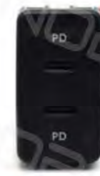
WNS-D02 Big Toyota Dual PD