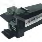
WNS-B14 Dual Nissan USB Input: DC12-24V Output: 5V/4.2A Material: ABS+Copper Hole size: 45*21*59mm