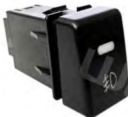
WNS-A15 T6 Small Isuzu Switch Input: DC12-24V Material: ABS+Copper Size: 39*21mm