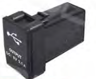
WNS-B05 Dual Small Toyota USB Input: DC12-24V Output: 5V/4.2A Material: ABS+Copper Hole size: 32*20mm