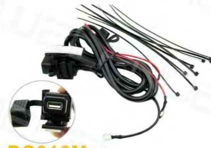
DS016M Single USB 2.4A 1.8 Meters cable