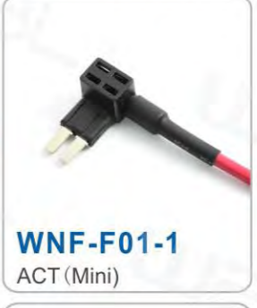
WNF-F01-1 ACT (Mini)