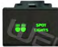
WNS-A08 T5 Small Volkswagen Switch Input: DC12-24V Material: ABS+Copper Size: 40*20*61mm