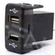
WNS-C02 Dual Big Toyota USB +Digital

Input: DC12-24V Output: 5V/2.1A Material: ABS+Copper Size: 40*20mm