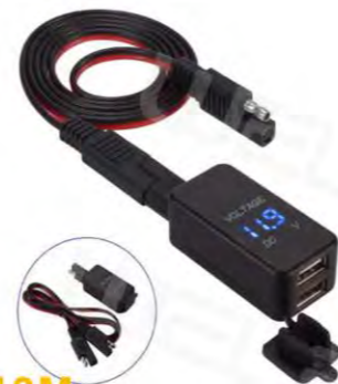
DS013M USB with Voltmeter 2.4A*2+V 1 Meter SAE cable