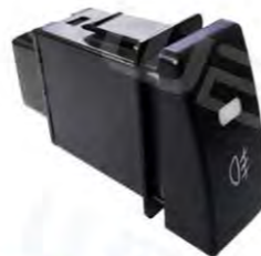
WNS-A14 T6 Big Isuzu Switch Input: DC12-24V Material: ABS+Copper Size: 33*22mm