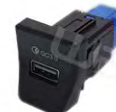
WNS-D16 Wildlander QC3.0

Input: DC12-24V Output: 5V/2.1A Material: ABS+Copper Size: 44*26mm