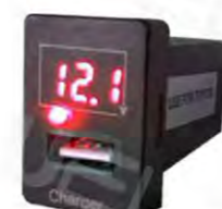
WNS-C04 Small Toyota USB +Digital

Input: DC12-24V Output: 5V3.0A/9V2.0A/12V1.5A Material: ABS+Copper Size: 32*20mm