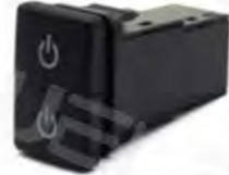
WNS-A04 Dual Small Toyota Switch Input: DC12-24V Material: ABS+Copper Size: 32*20*52mm