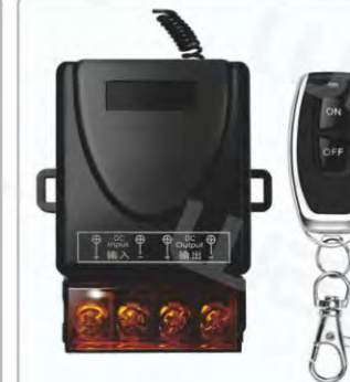
DS008D Wireless remote control switch 66mm*44mm*29mm