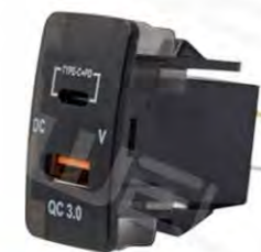
WNS-C12 Toyota PD+USB +Digital

Input: DC12-24V Output: 5V/2.1A Material: ABS+Copper Size: 43*25mm