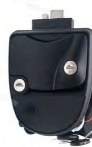
DS009D RV Door Lock with Fingerprint Unlock