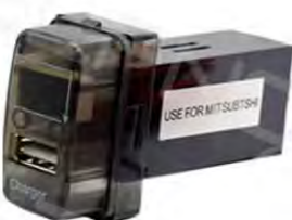
WNS-C16 Mitsubishi USB+Digital

Input: DC12-24V Output: 5V/2.1A Material: ABS+Copper Size: 35*24*58mm