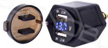
DS008M USB with Voltmeter