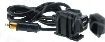
DS015M02 BMW Plug to USB 3.1A 1.82 Meters cable