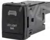
WNS-A09 T43 Tiida Switch Input: DC12-24V Material: ABS+Copper Size: 30*23mm