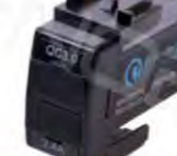
WNS-B09 T45 Small Toyota QC3.0 Input: DC12-24V Output: 5V3.0A/9V2.0A/12V1.5A Material: ABS+Copper Size: 22*22*58mm