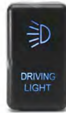
WNS-A10 T30 Ford Switch Input: DC12-24V Material: ABS+Copper Size: 32*20*52mm