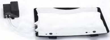
IY-011 Pneumatic four-way lumbar support