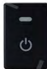
WNS-A17 T6B Isuzu Switch Input: DC12-24V Material: ABS+Copper Size: 53.2*32.6mm