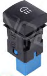
WNS-A05 T45 Small Toyota Switch Input: DC12-24V Material: ABS+Copper Size: 33*23mm