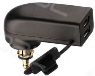
DS011M New BMW USB 2.4A*2