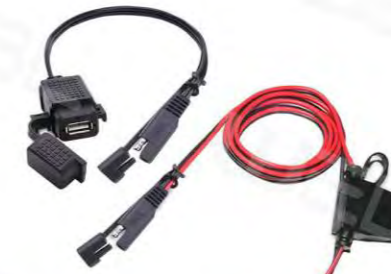
DS017M Single USB 2.4A 1.2 Meters Fuse cable