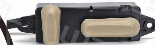
IY-002 Seat adjustment switch 4/6/8 way