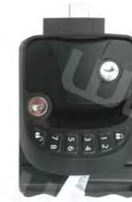
DS006D Keyless Entry RV Door Lock Material: Zinc alloy