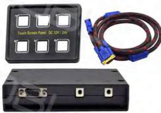
IB-PJ604 6 Gang Touch Screen Panel

Input: DC 12-24V Current: 40A-80A Fusing speed: F