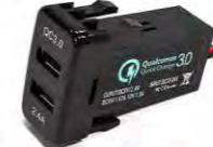
WNS-B03 Big Toyota QC3.0 +2.4A Input: DC12-24V Output: QC3.0+5V/2.4A Material: ABS+Copper Size: 40*20mm