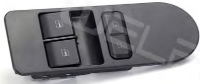
IY-009 Driver's window switch