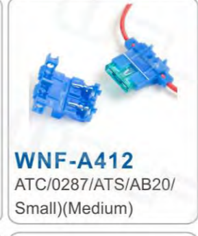
WNF-A412 ATC/0287/ATS/AB20/ Small)(Medium)