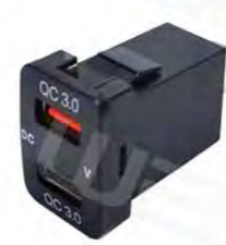
WNS-C08 Dual Small Toyota QC3.0+Digital

Input: DC12-24V Output: 5V3.4A/9V2.5A/12V2A Material: ABS+Copper Size: 40*20mm