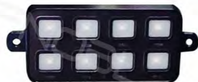
IB-PJ805 8 Gang Control Box with Dual Panel

Input: DC 12-24V Material: PVC Function selection: Physical button Shell color: BU/BL