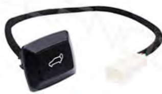
WNS-A16 Toyota Tailgate Switch Input: DC12-24V Material: ABS+Copper Hole size: 100*45mm