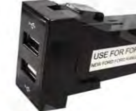
WNS-B22 Dual Ford USB Input: DC12-24V Output: 5V/4.2A Material: ABS+Copper Size: 38*23mm