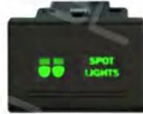
WNS-A07 T5 Big Volkswagen Switch Input: DC12-24V Material: ABS+Copper Size: 43*27mm