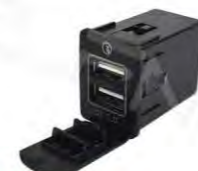
WNS-B17 New Style Dual Honda USB Input: DC12-24V Output: 5V/4.2A Material: ABS+Copper Hole size: 35*18mm