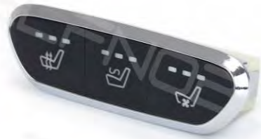
IY-008 Three key switch