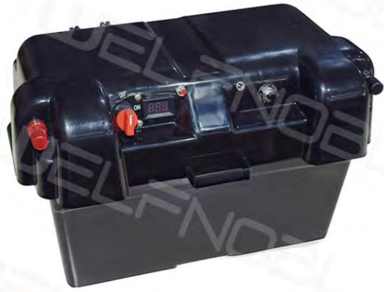
DS004H Smooth Battery Box

Product size(L/W/H):415*235*320mm Capacity size(L/W/H):360*205*208mm