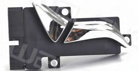
IY-004 Seat adjustment switch 4/6/8 way