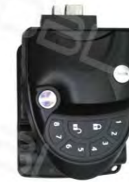
DS002D RV Door Lock

Material: Zinc alloy + plastic Size: 151*118*88mm