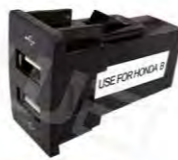
WNS-B20 Dual Suzuki USB Input: DC12-24V Output: 5V/4.2A Material: ABS+Copper Hole size: 44*22mm