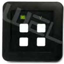
IB-PJ401 4 Gang Smart Touch Screen Panel

Input: DC 12V Material: Aluminum+PVC Function selection: Bluetooth APP/physical button Shell color: BL