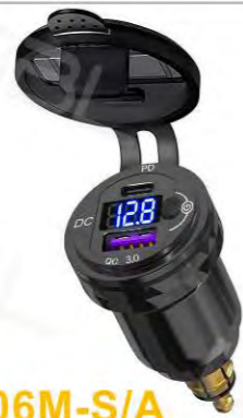
DS006M-S/A BMW AL USB QC3.0+PD3.0+V With Switch