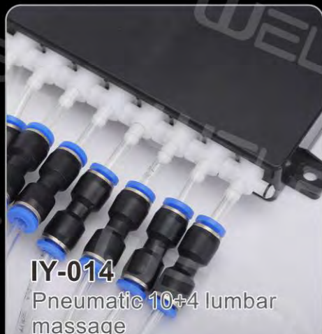
IY-014 Pneumatic 10+4 lumbar massage