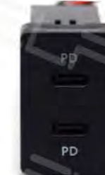
WNS-D04 Small Toyota Dual PD