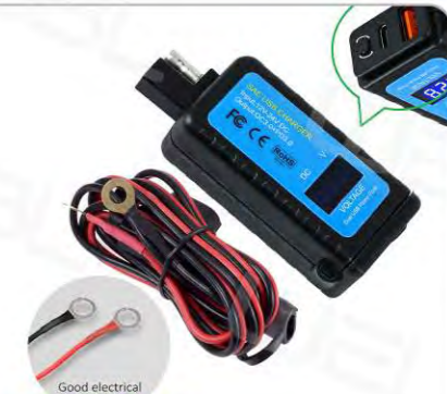
DS020M02 Double USB QC3.0+PD3.0+V 1.2 Meters Fuse cable