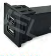
WNS-D13 Volkswagen T5 Dual USB(Convex)

Input: DC12-24V Output: 5V Material: ABS+Copper Size: 32*32mm