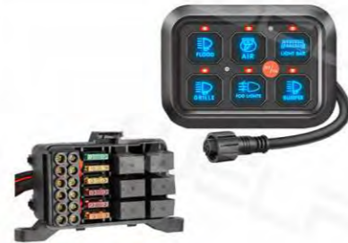
IB-PJ603 6 Gang Switch Panel with Relay Box

Input: DC 12-24V Material: Metal+ABS Light color: BU/RD