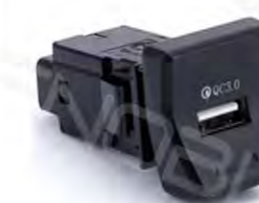
WNS-D15 Wildlander QC3.0

Input: DC12-24V Output: 5V/2.1A Material: ABS+Copper Size: 44*26mm