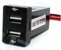
WNS-B15 Nissan QC3.0+2.4A Input: DC12-24V Output: QC3.0+5V/2.4A Material: ABS+Copper Size: 44*21mm