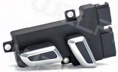
IY-005 Seat adjustment switch 4/6/8 way