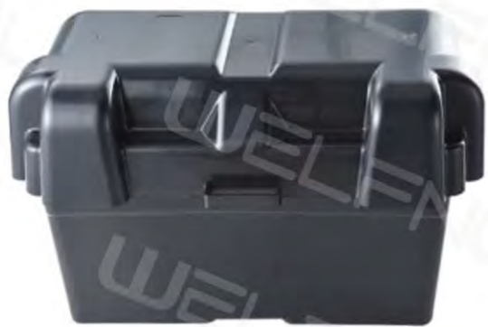
DS008H Smooth Battery Box

Product size(L/W/H):337*249*265mm Capacity size(L/W/H):381*193*201mm Net weight:0.98Kg