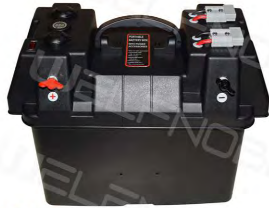
DS005H Smooth Battery Box

Product size(L/W/H):415*235*320mm Capacity size(L/W/H):360*205*208mm