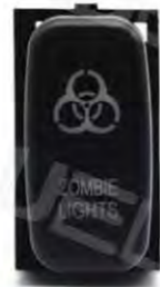
WNS-A12 T10 Mitsubishi Switch Input: DC12-24V Material: ABS+Copper Size: 40*21mm