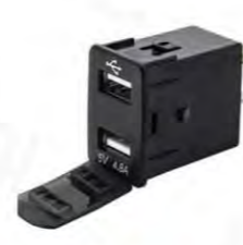
WNS-C10 New Style Nissan USB+Digital

Input: DC12-24V Output: 5V/2.1A Material: ABS+Copper Hole size: 45*21*59mm