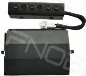
IB-PJ602 6 Gang Control Box with Switch

Input: DC 12-24V Current: 40A-80A Fusing speed: F