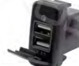
WNS-B02 Big Toyota QC3.0 Input: DC12-24V Output: 5V3.0A/9V2.0A/12V1.5A Material: ABS+Copper Size: 40*20*38mm