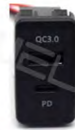
WNS-D01 Big Toyota QC3.0 +PD

Input: DC12-24V Output: 5V/3.1A Material: ABS+Copper Hole size: 32*20mm