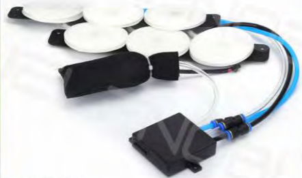
IY-012 Pneumatic 6-point massage