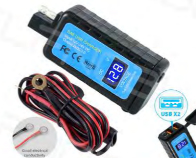
DS021M02 Double USB QC3.0*2+V 1.2 Meters Fuse cable