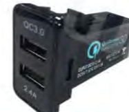
WNS-B12 Honda QC3.0+2.4A Input: DC12-24V Output: QC3.0+5V/2.4A Material: ABS+Copper Size: 35*18mm