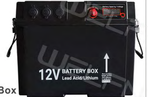
DS002H 12V Battery Box

Material: PP Product size(L/W/H):423*254*328mm Capacity size(L/W/H):358*208*208mm Net weight:1.38Kg