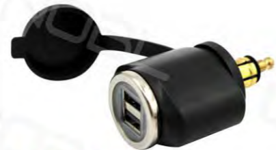
DS010M 2.1A*2+V BMW USB 3.3A