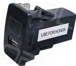
WNS-C11 Toyota USB+Digital

Input: DC12-24V Output: 5V/2.1A Material: ABS+Copper Size: 43*25mm