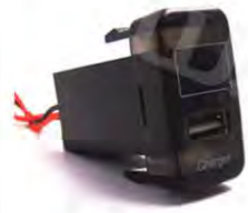
WNS-C01 Big Toyota USB +Digital

Input: DC12-24V Output: 5V/2.1A Material: ABS+Copper Size: 40*20mm