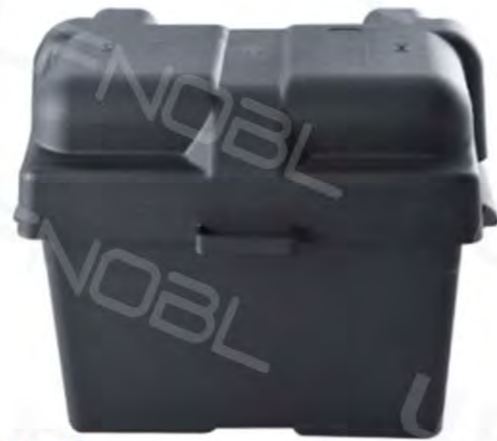
DS007H Smooth Battery Box

Material:PP Product size(L/W/H):465*257*265mm Capacity size(L/W/H):370*198*201mm Net weight:1.86Kg