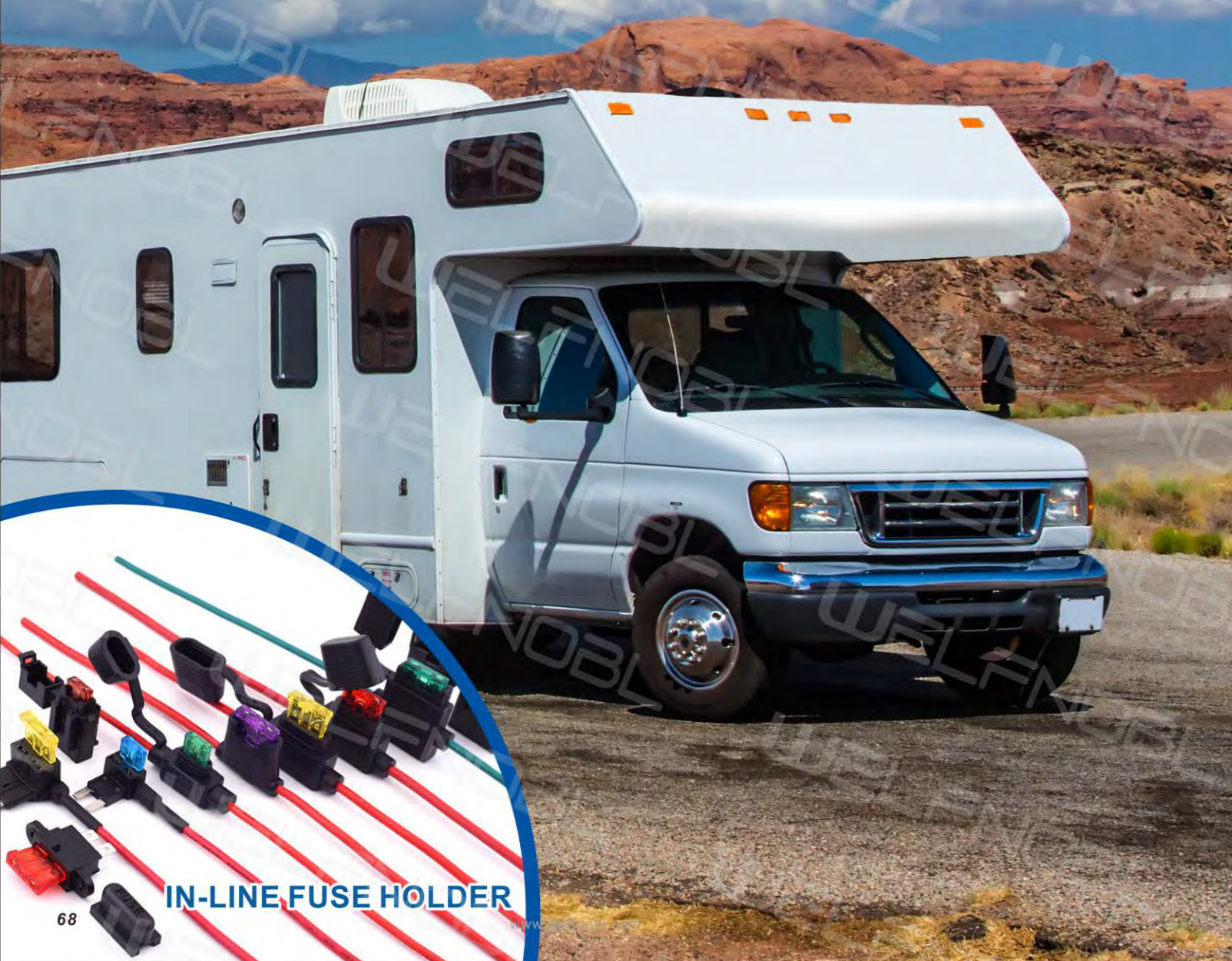
IN-LINE FUSE HOLDER

Ensure that when the current passing through the circuit is too high, there will be a fusing phenomenon and the entire circuit will be disconnected. This can effectively protect the circuit when the current is too high, avoiding the risk of the entire circuit catching fire.