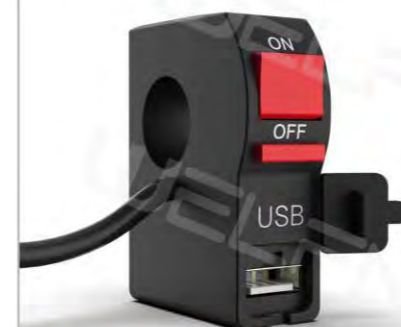
DS022M02 Electric Vehicle Motorcycle With USB