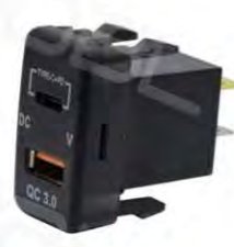
WNS-C07 Big Toyota PD+QC3.0 +Digital

Input: DC12-24V Output: 5V3.4A/9V2.5A/12V2A Material: ABS+Copper Size: 32*20mm